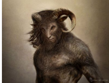
Claudius- new husband